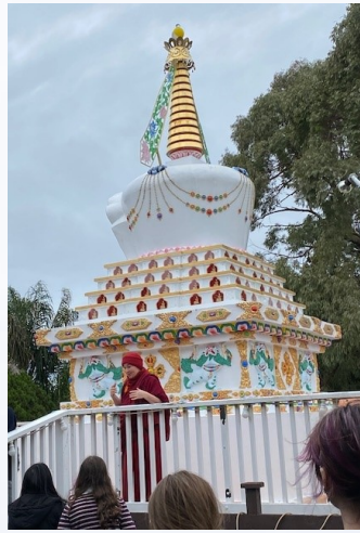
Photos from the Dorje Chang Institute Buddhist Monastery and Holy Trinity Cathedral, Parnell.