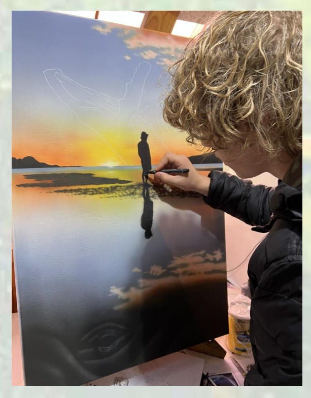
Leon Kment, "Be-gazing", 2024, air brush