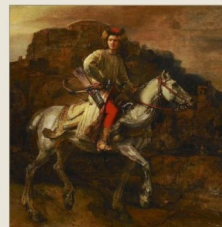
THE POLISH RIDER REMBRANDT