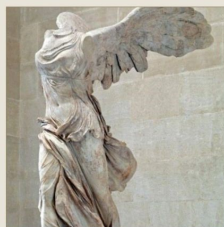
THE NIKE OF SAMOTHRACE