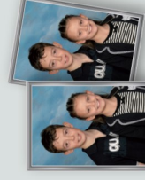
2 medium 13 x 18cm with mounts