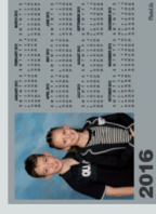
1 calendar 18 x 13cm