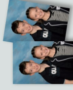
2 small 6.4 x 9cm