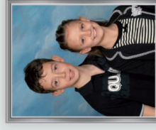
1 large 20 x 25cm with mount