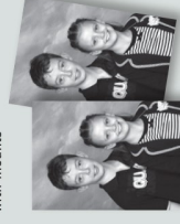
2 medium 13 x 18cm black and white