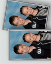
2 medium 13 x 18cm with mounts